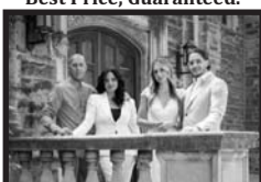
The Vescio Family ★★★★★ vesciofuneralhome.com